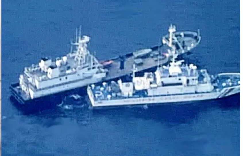
Use of water cannon, dangerous maneuvers, and collisions are now becoming regular occurrences in the WPS.