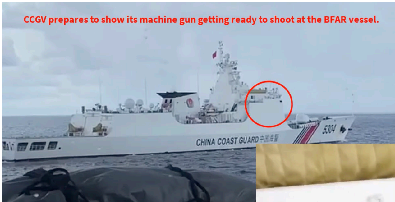
CCGV prepares to show its machine gun getting ready to shoot at the BFAR vessel.

China has steadily escalated its actions to threats of use of the force, such as by exposing and preparing weapons and using a blinding laser against Philippine government vessels.