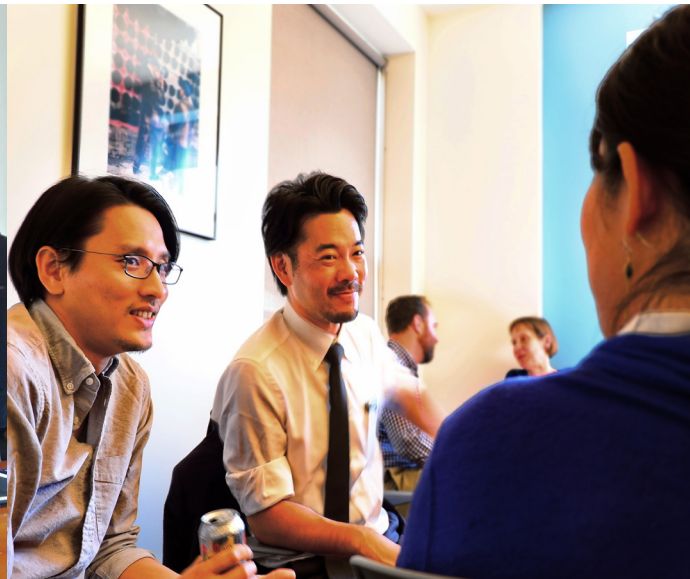
Lunchtime conversations during the 2017 workshop.