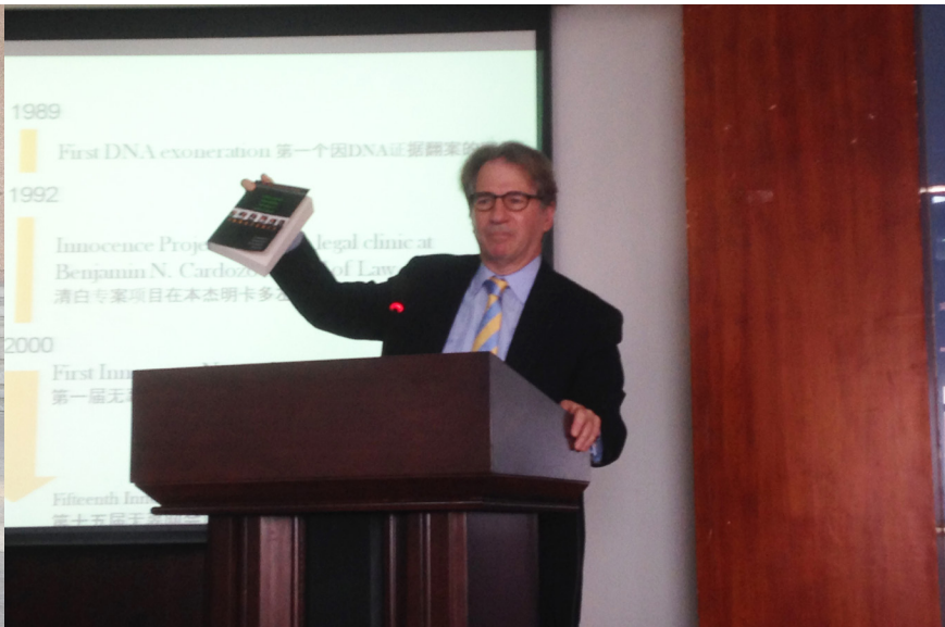
Barry Scheck discussing his publications during USALI's 2015 visit to China.