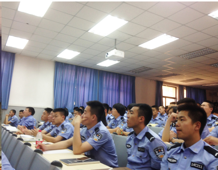
A full house of students at the People's Public Security University.