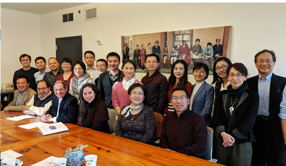
A discussion with The Exoneration Initiative (EXI) during the 2018 workshop at New York University.