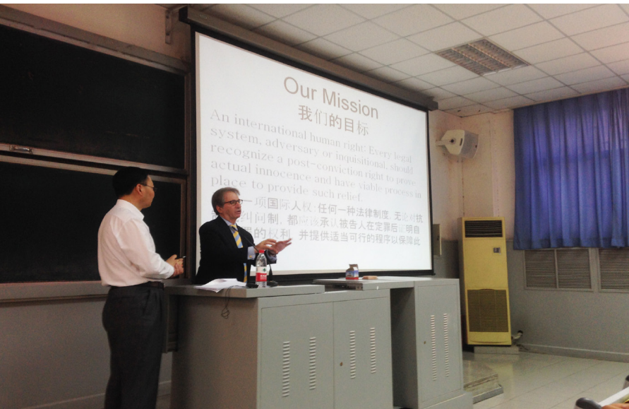
Barry Scheck introduces the mission of the Innocence Project at the People's Public Security University of China.