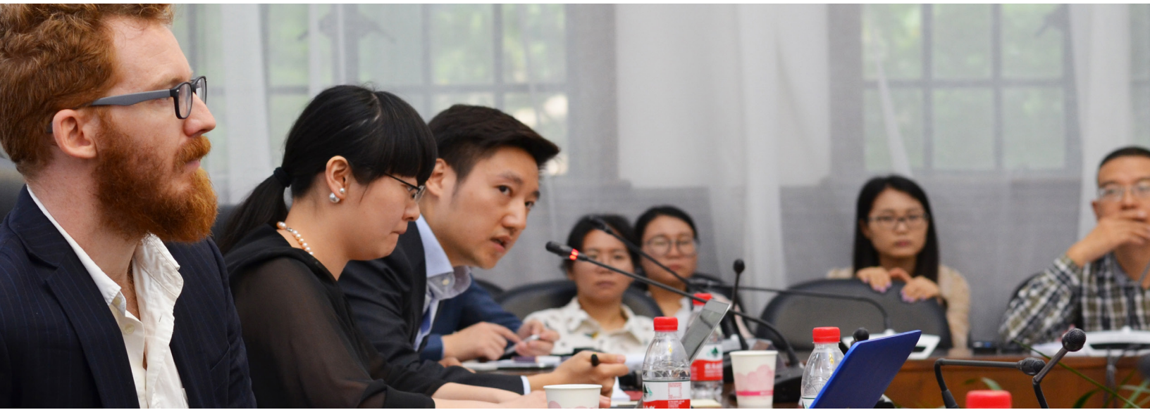
USALI at a round table discussion on wrongful convictions at East China University of Politics and Law (ECUPL) in 2018.