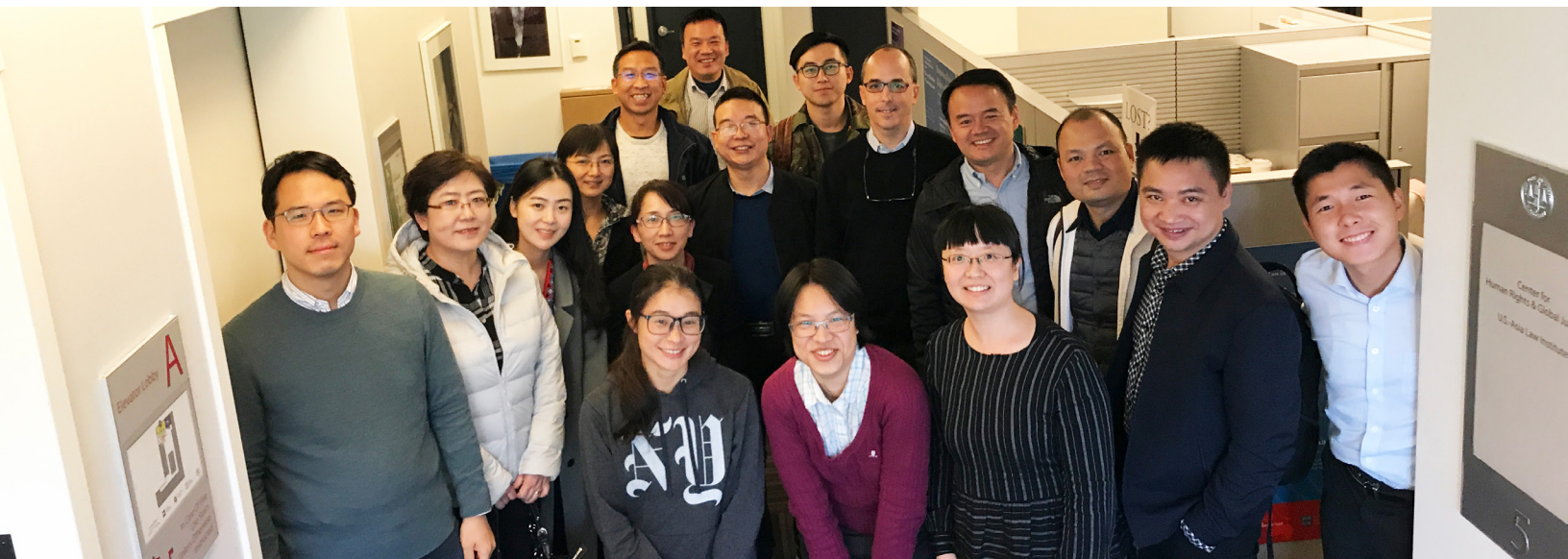
A group photograph of our 2018 workshop participants at the USALI office in New York City.