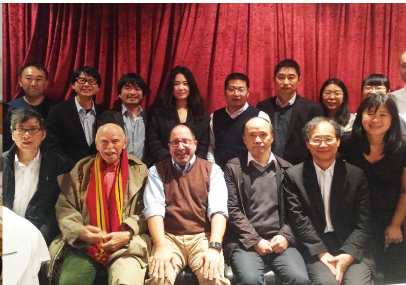
A visit to the Office of the Chief Medical Examiner in New York City.