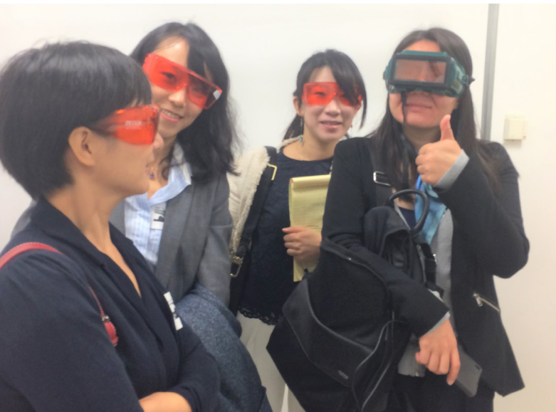
Gearing up for a visit to the Office of the Chief Medical Examiner.